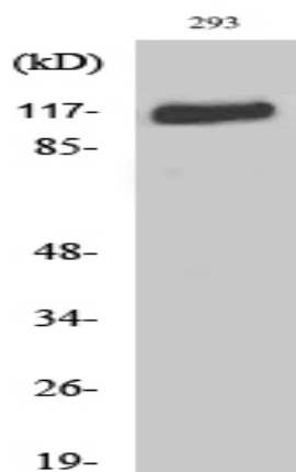
Western Blot analysis of various cells using Flg Polyclonal Antibody diluted at 1:1000