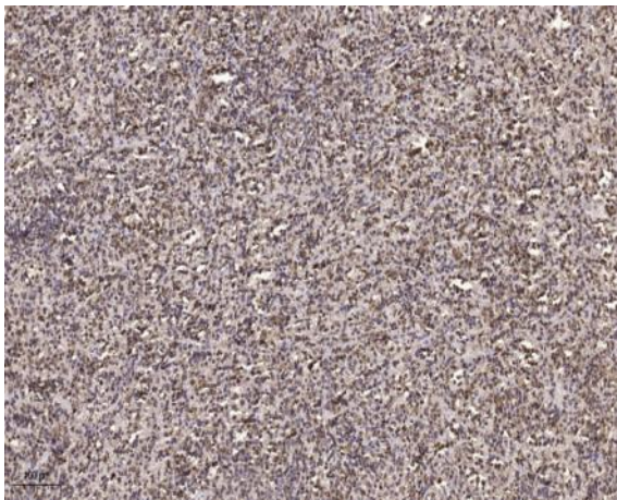
Immunohistochemical analysis of paraffin-embedded human spleen. 1, Tris-EDTA, pH 9.0 was used for antigen retrieval. 2 Antibody was diluted at 1:200 (4° overnight). 3, Secondary antibody was diluted at 1:200 (room temperature, 45min).