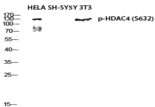
Western blot analysis of HELA SH-SY5Y 3T3 lysis using Phospho-HDAC4 (S632) antibody. Antibody was diluted at 1:1000