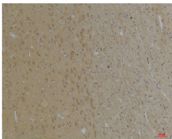
Immunohistochemical analysis of paraffin-embedded Rat Brain Tissue using KCNK4 (TRAAK) Rabbit pAb diluted at 1:200.