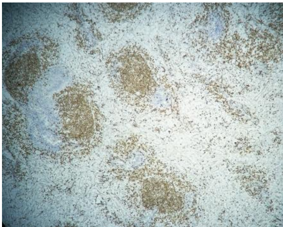
Rat spleen tissue was stained with Anti-PAX-5 (PTR1332) Antibody