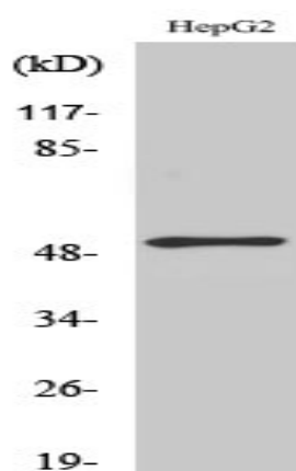
Western Blot analysis of various cells using ATF-2 Polyclonal Antibody