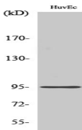
Western Blot analysis of various cells using Cadherin-26 Polyclonal Antibody