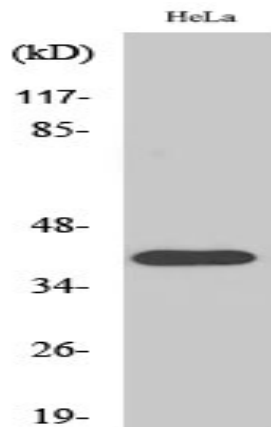
Western Blot analysis of various cells using P2RY8 Polyclonal Antibody diluted at 1:2000