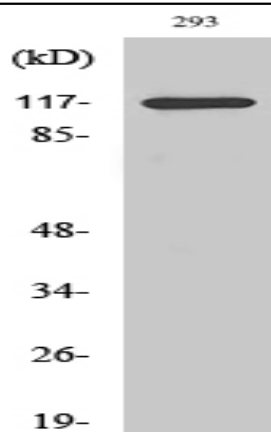
Western Blot analysis of various cells using Phospho-HDAC4 (S632) Polyclonal Antibody diluted at 1:1000