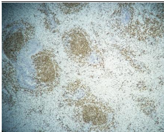
Rat spleen tissue was stained with Anti-PAX-5 (PTR1332) Antibody